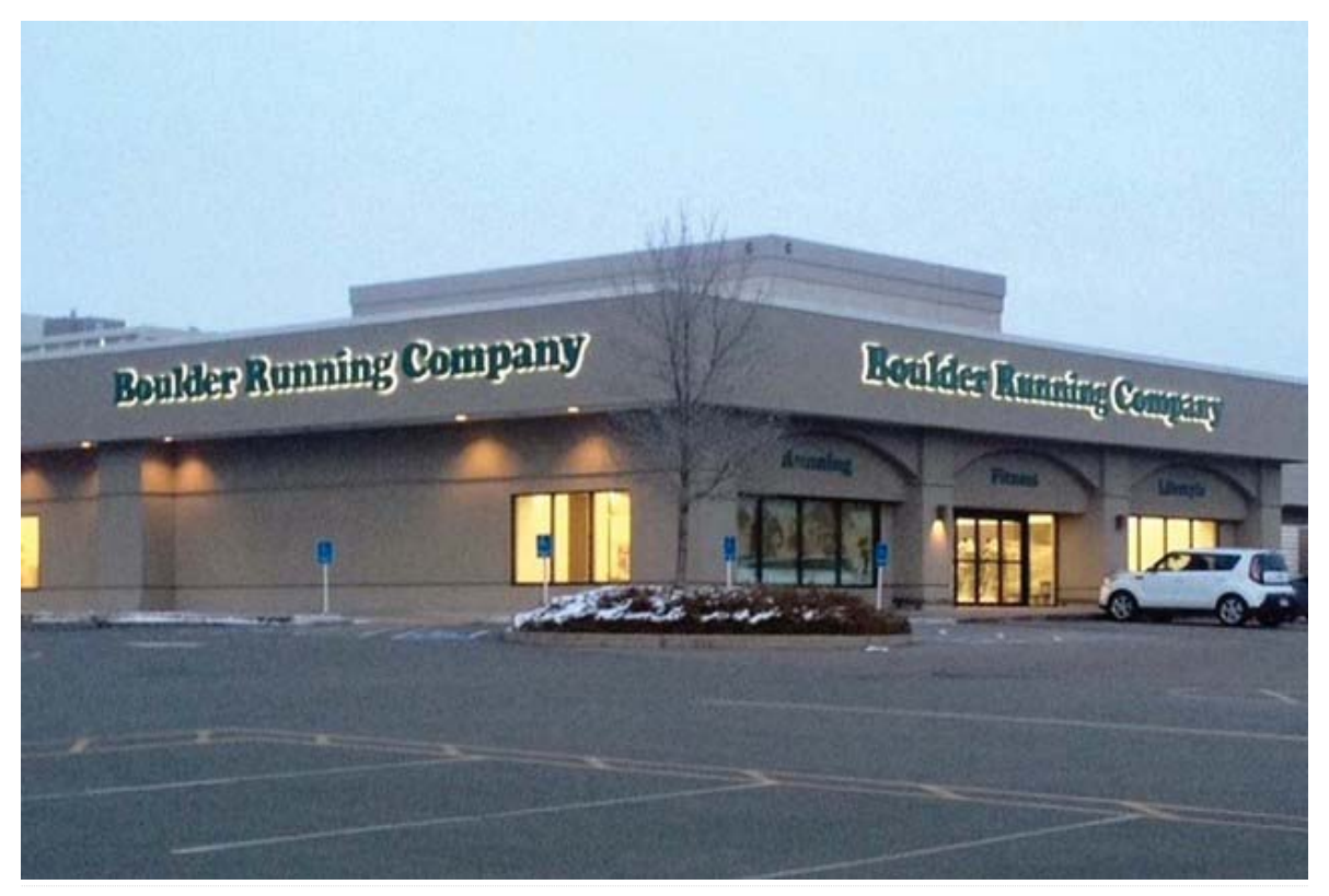
Denver's Cherry Creek Shopping Center is home to Boulder Running Co.'s latest location.

The Boulder Running Co. is reimagining the supersized sports store.